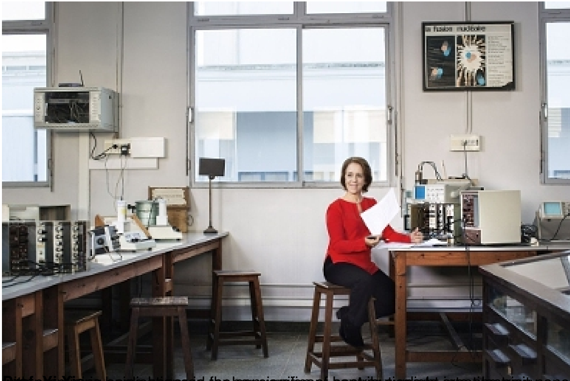
Her research has helped understand the mechanisms of how the immune system fights off pathogens and how it can be trained to fight off cancer materials