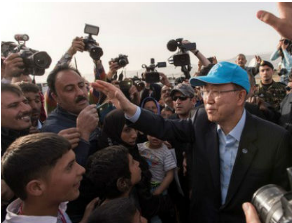
Secretary-General Visits Syrian Refugee Camp in Beqaa Valley, Lebanon.