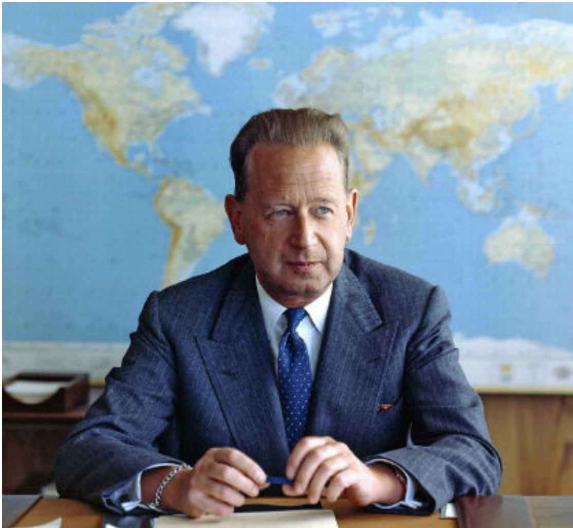
Dag Hammarskjöld, 1959.

13 September 2016—“I have no doubt that 40 years from now we shall be engaged in the same pursuit. How could we expect otherwise? World organisation is still a new adventure in human history” – Dag Hammarskjöld, May 1956.□