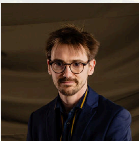
Arne Focketyn Film Director

The film will be followed by a panel discussion with