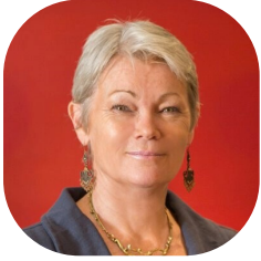
Tracy Edwards Maiden's Skipper MBE

Tracy Edwards, MBE, is a British sailor. In 1989 she skippered the first all-female crew in the Whitbread Round the World Yacht Race, becoming the first woman to receive the Yachtsman of the Year Trophy and was awarded an MBE honour. Tracy now has 30 years experience creating and running sailing projects and currently oversees the Maiden Factor project. Tracy continues to change the narrative of what girls can achieve.